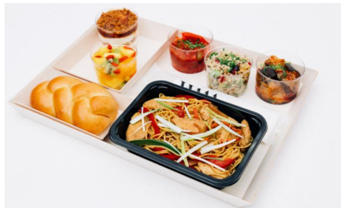
Trays sealed with PLA

We have developed a large range of boxes and trays to cover all needs of services.